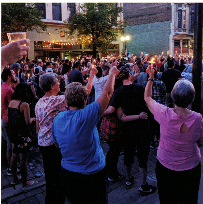
Sisters of the Precious Blood at the Oregon District Prayer Vigil