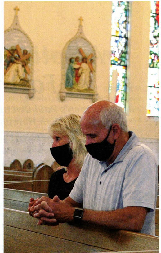
Mass at Holy Trinity honored those who died in the Oregon District one year later.