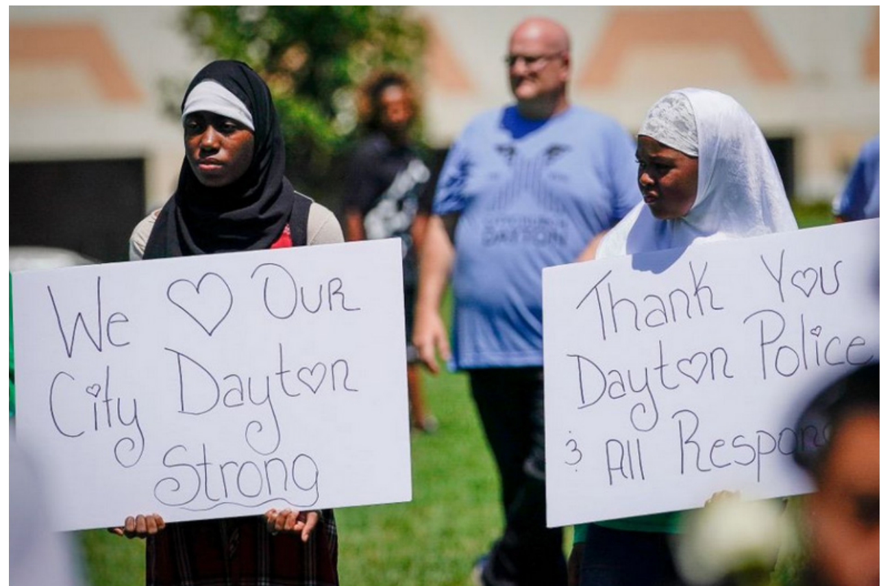
Top, people gather in Dayton, Ohio, Aug. 4 after a gunman killed nine people at a nightclub in the early morning.