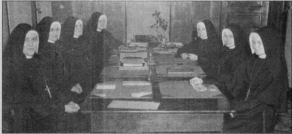
PICTURED ARE SEVEN of the Precious Blood Sisters who lived at the Holy Trinity Convent and worked in the Holy Trinity School. The time is prior to 1955.

"Later at a choir practice our director wanted us to listen to a song before we began practicing. He played Dona Nobis Pacem for us from our