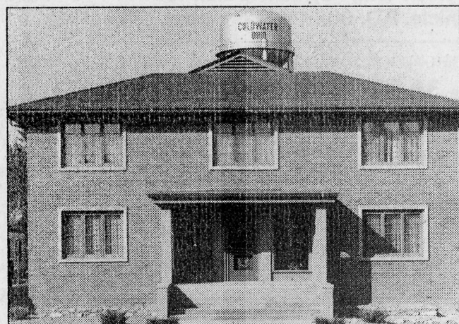
THE HOLY TRINITY CONVENT, that was dedicated in October 1953, also housed a food pantry and CCD classes and offices until 1992. It was for a time rented out and then in 2002 was redecorated and is now used for parish offices.